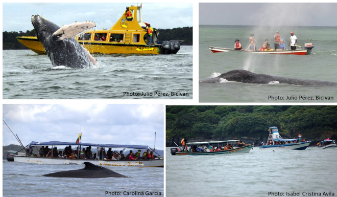
Figure 4. Typical whale-watching boats at Uramba Bahía Málaga Natural National Park, Colombia, between 2011 and 2020.

36% of Buenaventura boats run directly to do whale watching without attending the talk offered by environmental authorities, without taking any interpreter and without receiving any flag.