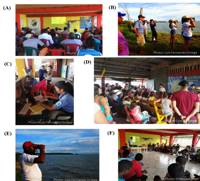
Figure 2. Urumba Bahía Málaga National Natural Park' staff assignments during whale-watching seasons; (A) Workshop with boat operators about whales and whale-watching good practices; (B) Training volunteers (Volunteer Ranger Program) in watching whales and boats from the shore platform; (C) Boat operators' control before the whale-watching tour and filling of the Park's official records; (D) Pre-whale-watching tour talks to tourists; (E) Observation of whales and boats from the shore platform; and (F) Training environmental interpreters (guides) in biology of whales and conservation actions.